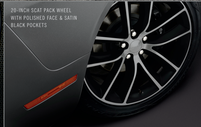
20-INCH SCAT PACK WHEEL WITH POLISHED FACE & SATIN BLACK POCKETS