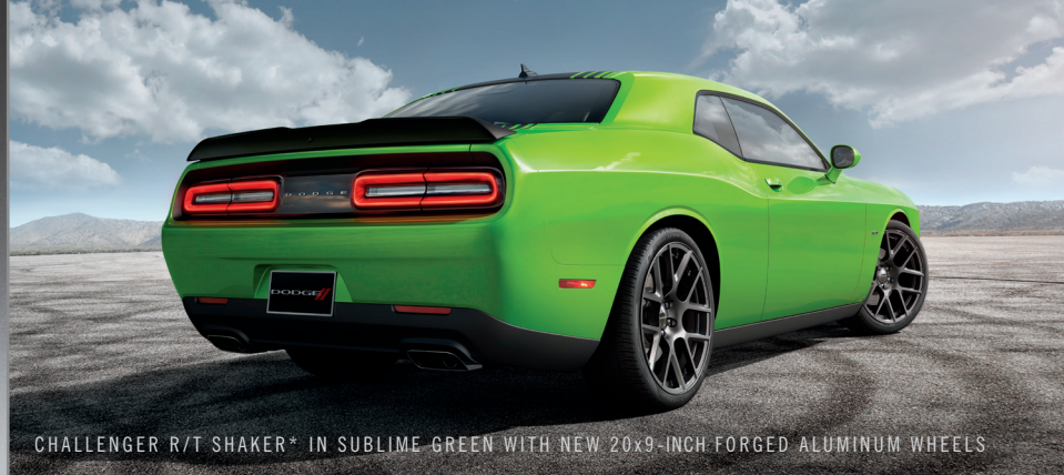
CHALLENGER R/T SHAKER* IN SUBLIME GREEN WITH NEW 20x9-INCH FORGED ALUMINUM WHEELS