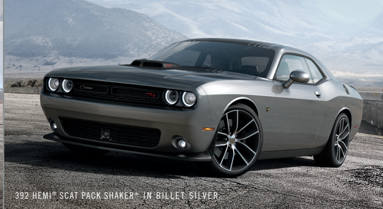
392 HEMI® SCAT PACK SHAKER* IN BILLET SILVER