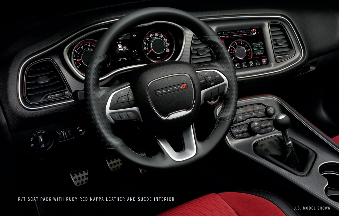
R/T SCAT PACK WITH RUBY RED NAPPA LEATHER AND SUEDE INTERIOR