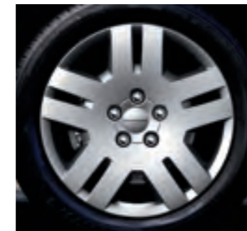
17-INCH WHEEL COVER Standard on CVP (W7A)