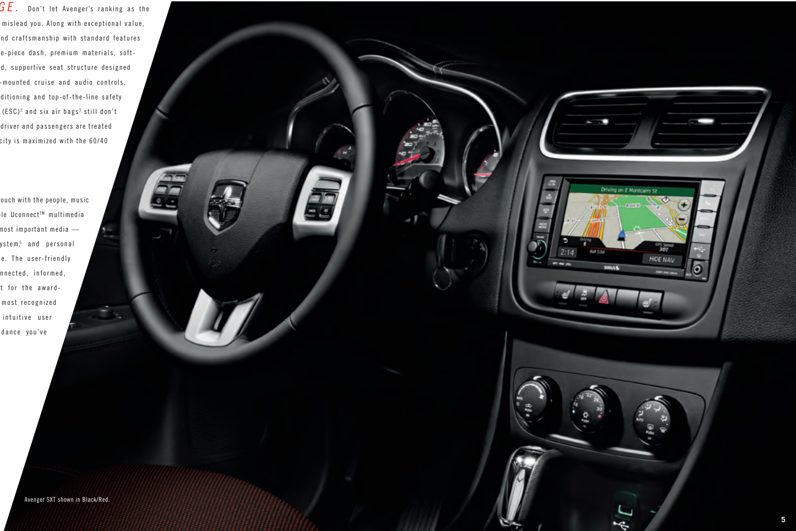
Avenger SXT shown in Black/Red.