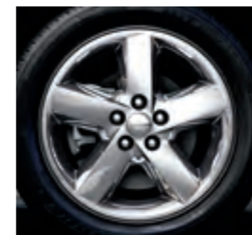
18-INCH CHROME-CLAD ALUMINUM Available on SXT (WPL)