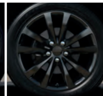
18-INCH GLOSS BLACK ALUMINUM Included with Blacktop Group on CVP and SXT (WPE)