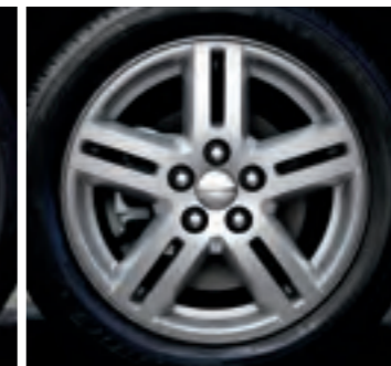
17-INCH ALUMINUM Available on CVP (WFJ)