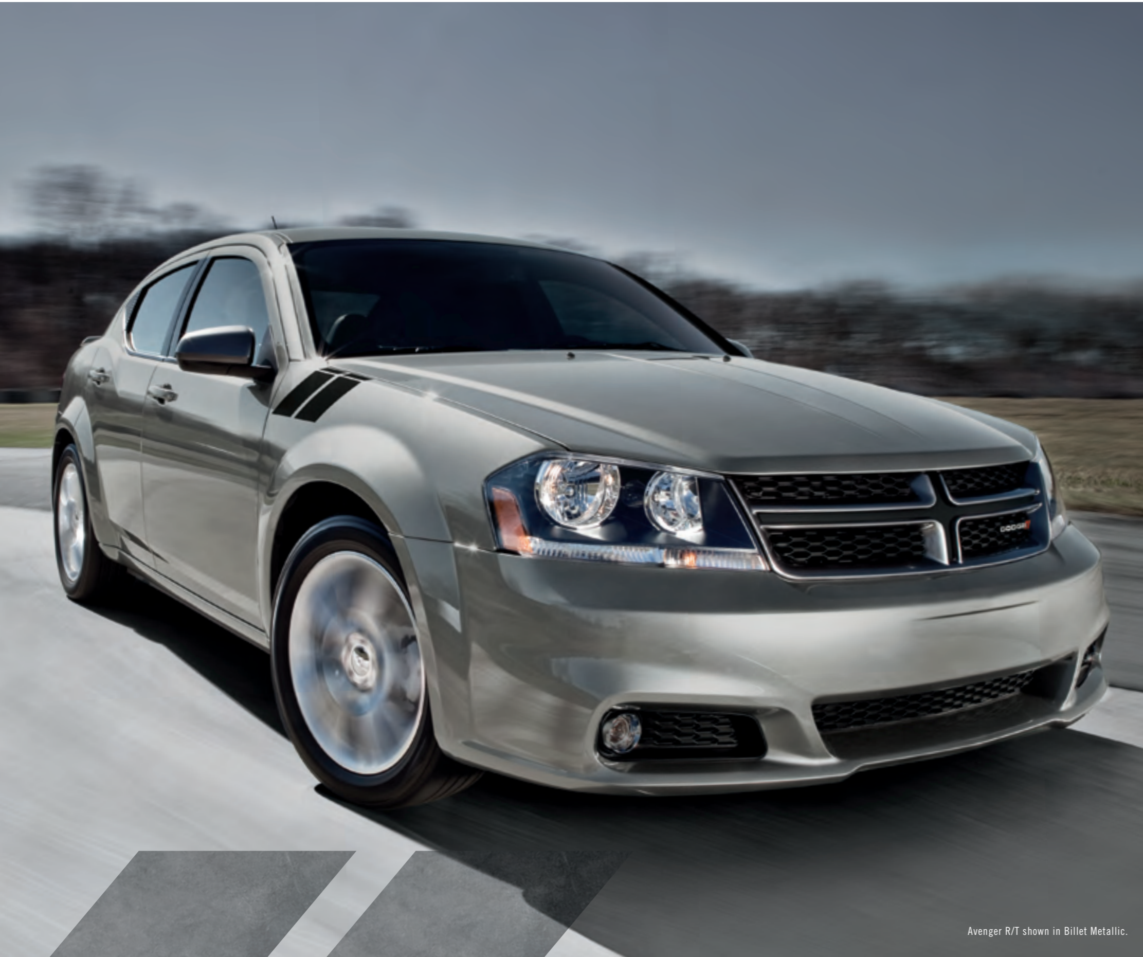
Avenger R/T shown in Billet Metallic.

BUILT TO HUSTLE. Designed to deliver power and performance, Avenger offers two formidable engine options: the 2.4L I-4 delivering up to 6.4 L/100 km (44 mpg) highway* and the award-winning 3.6L Pentastar™ Variable Valve Timing (VVT) V6 with 283 horsepower and up to 6.8 L/100 km (42 mpg) highway.*