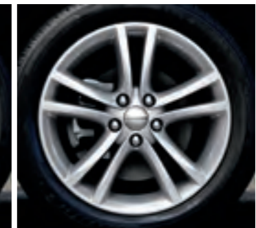
18-INCH CAST ALUMINUM Standard on SXT (WPT)