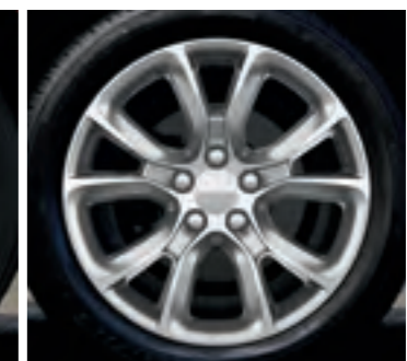
18-INCH RALLYE DESIGN ALUMINUM Standard on R/T (WPK)